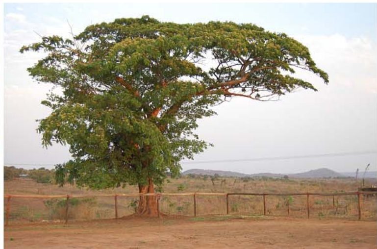
Albizia adianthifolia (Schumach.) W.F. Wight Chimoio, at horse riding school at old pig farm behind TextAfrica; E 33°30'12.43" S 19° 8'3.86" , alt 700 m