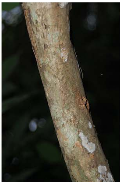
Millettia mossambicensis J.B. Gillett Sofala province, Cheringoma plateau, along marked trail in Catapú; S 18°01', E 35°18'; alt 90 m