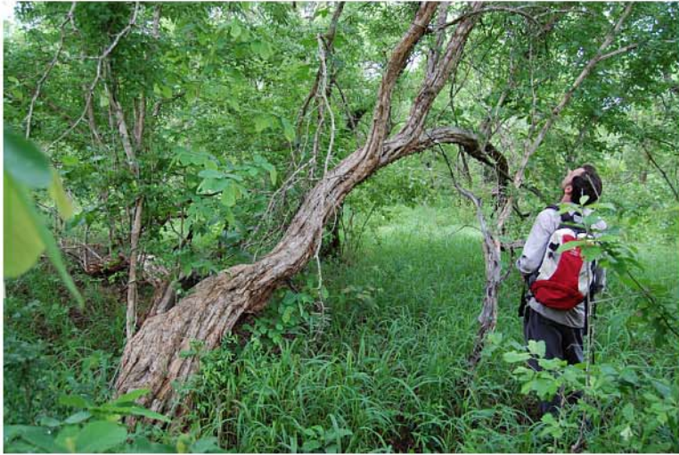
Dalbergia melanoxylon Guill. & Perr. Sofala province, Cherigoma plateau, along marked trail in Catapú; S 18°01', E 35°18'; alt 90 m