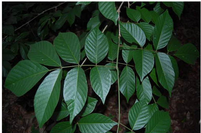
Millettia mossambicensis J.B. Gillett Sofala province, Cheringoma plateau, along marked trail in Catapú; S 18°01', E 35°18'; alt 90 m