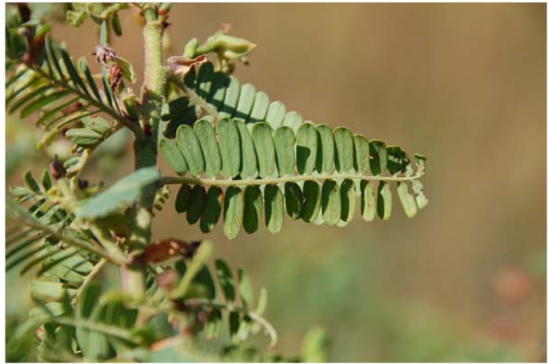
Aeschynomene nodulosum Chimanimani mountains, upper reaches of Nhamadzi basin, before getting to the plateau of the Muvumodzi headwaters; E 33.08, S 19.76, alt 1650 m