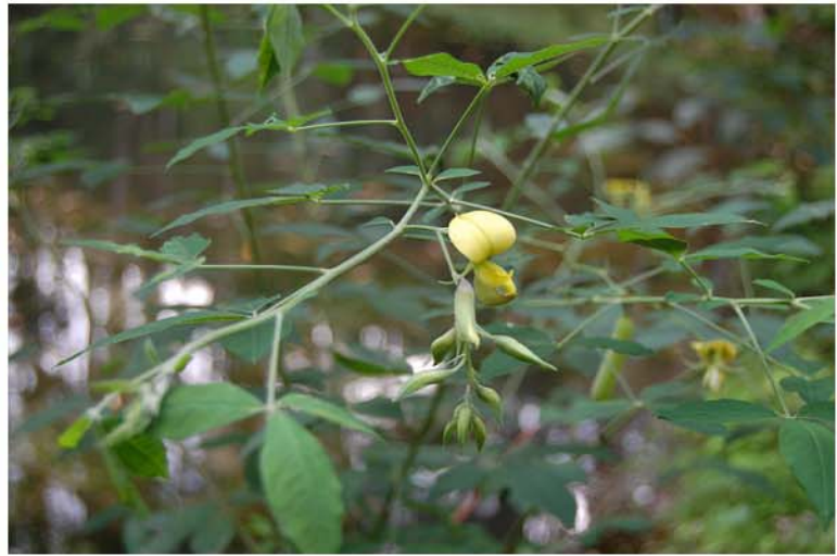
Crotolaria sp. in botanical garden of Penhalonga, Quinta da Fronteira; E 32 44' 37" S 18 51' 09" at 1100 m