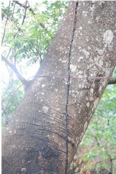
Albizia schimperiana Oliv. (?) on Mt Vumba, south of Manica town, between fields; E 32.87, S 18.97, alt 1000 m