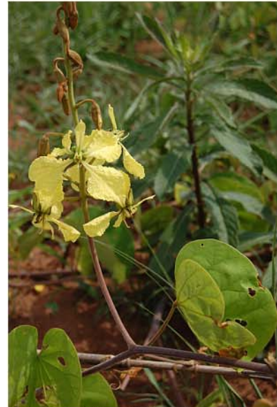
Tylosema fassoglense (Schweinf.) Torre & Hillcoat in fallow fields around ISPM; E 33.40, S 19.04, alt 700 m