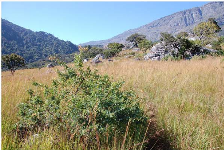
Aeschynomene nodulosum Chimanimani mountains, upper reaches of Nhamadzi basin, before getting to the plateau of the Muvumodzi headwaters; E 33.08, S 19.76, alt 1650 m