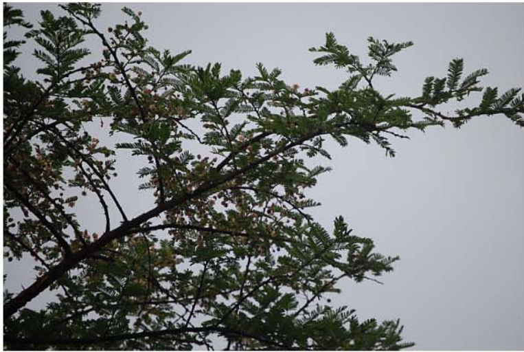
Acacia abyssinica Hochst. ex Benth. on Mt Vumba, south of Manica town, between fields; E 32.87, S 18.97, alt 1000 m