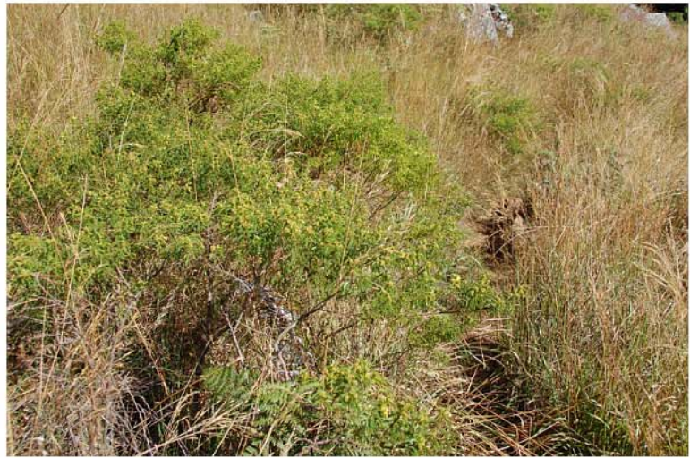
Kotschy thymodora (Baker f.) Wild Chimanimani mountains, upper reaches of Nhamadzi basin, before getting to the plateau of the Muvumodzi headwaters; E 33.08, S 19.76, alt 1650 m