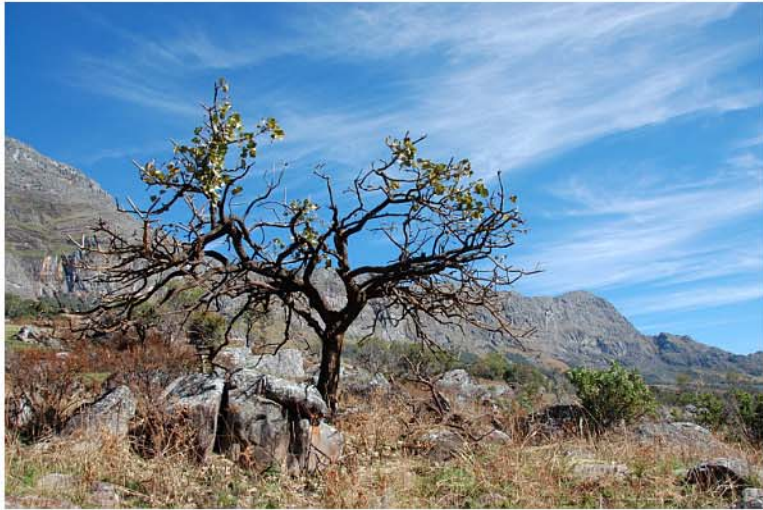
Erythrina abyssinica Lam. ex DC