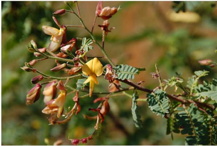
Aeschynomene nodulosum Chimanimani mountains, upper reaches of Nhamadzi basin, before getting to the plateau of the Muvumodzi headwaters; E 33.08, S 19.76, alt 1650 m