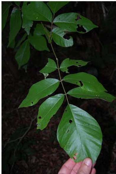
Millettia mossambicensis J.B. Gillett Sofala province, Cheringoma plateau, along marked trail in Catapú; S 18°01', E 35°18'; alt 90 m