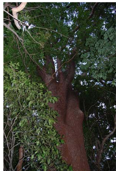
Cordyla africana Lour. Sofala province, Cheringoma plateau, along marked trail in Catapú; S 18°01', E 35°18'; alt 90 m