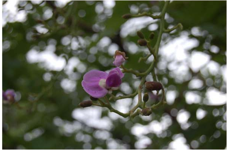
Millettia stuhlmannii Taub. at small botanical garden close small dam on Mt Garuso; E 33.17, S 18.96, alt 900 m