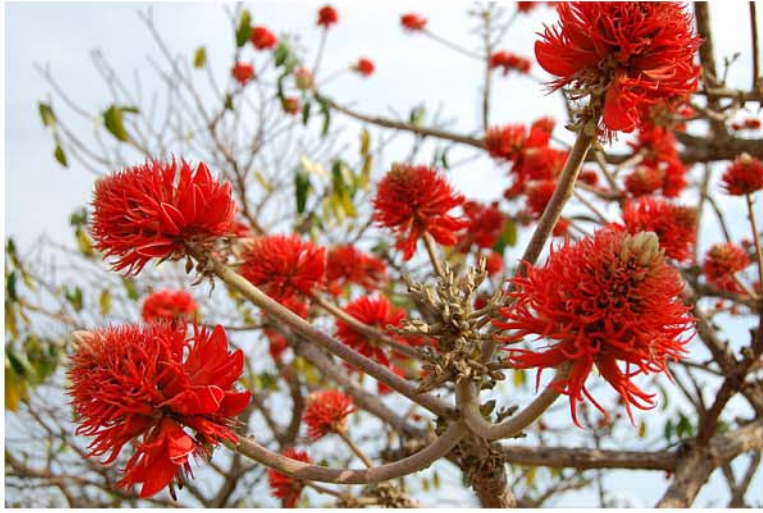
Erythrina abyssinica Lam. ex DC along road from Chimoio towards Manica; E 33.44, S 19.11, alt 650 m