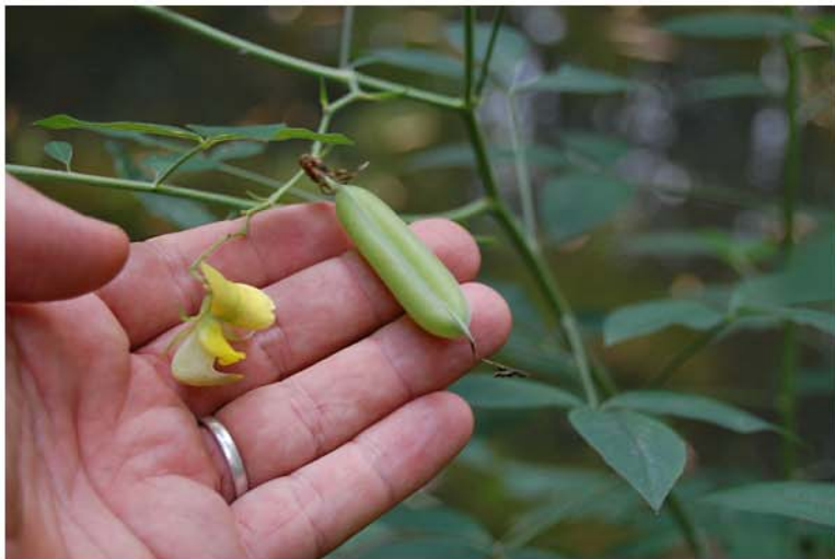
Crotolaria sp. in botanical garden of Penhalonga, Quinta da Fronteira; E 32 44' 37" S 18 51' 09" at 1100 m