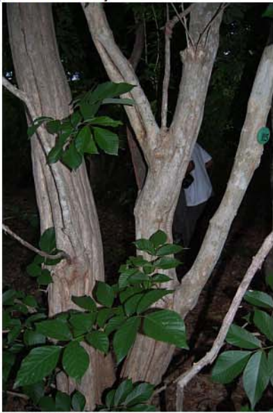
Millettia mossambicensis J.B. Gillett Sofala province, Cheringoma plateau, along marked trail in Catapú; S 18°01', E 35°18'; alt 90 m