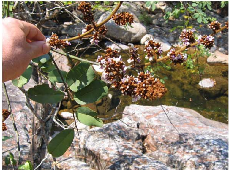
Dalbergia lactea Vatke Chimanimani mountains, along path lower reaches of Nhamadzi river; E 33.04, S 19.73, alt 1300 m