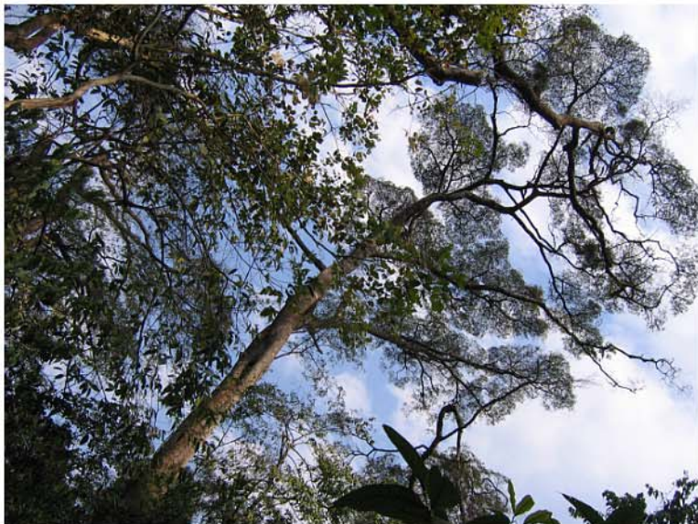
Newtonia buchananii (Baker) Gilbert & Boutique Moribane forest