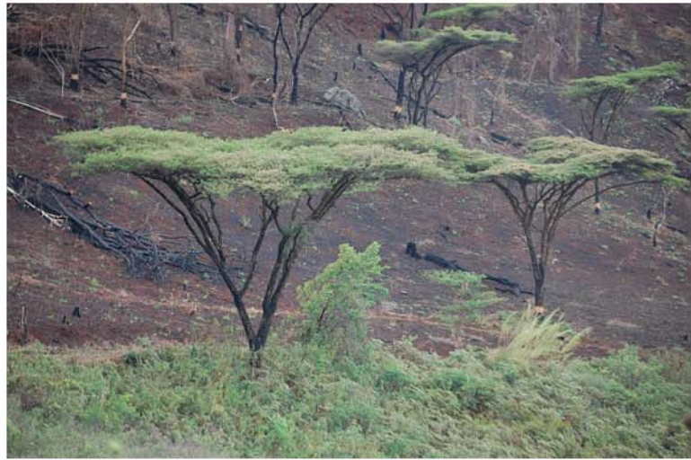
Acacia abyssinica Hochst. ex Benth. on Mt Vumba, south of Manica town, between fields; E 32.87, S 18.97, alt 1000 m