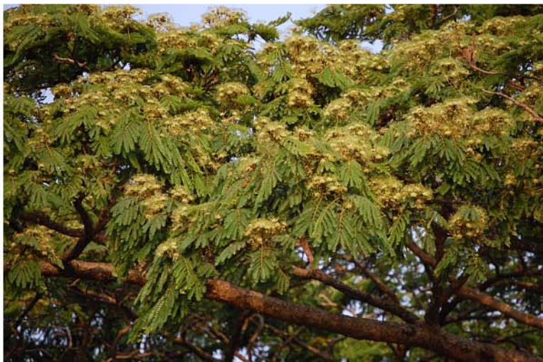
Albizia adianthifolia (Schumach.) W.F. Wight Chimoio, at horse riding school at old pig farm behind TextAfrica; E 33°30'12.43" S 19° 8'3.86" , alt 700 m