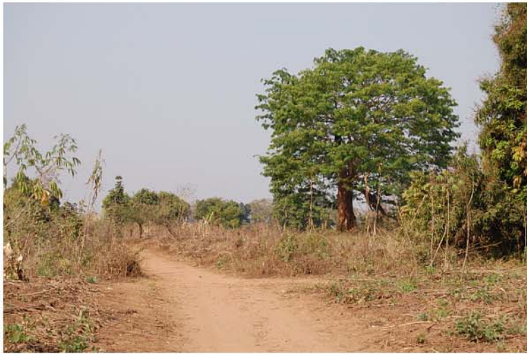
Cordyla africana Lour. in Lucite plains south-east of Dombe; E 33.48, S 19.97, alt 100 m