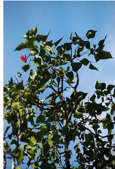
Erythrina lysistemon Hutch Chimanimani mountains, along Nhamadzi river, at second time crossing the river; E 33.06, S 19.75m qit, 1300 m