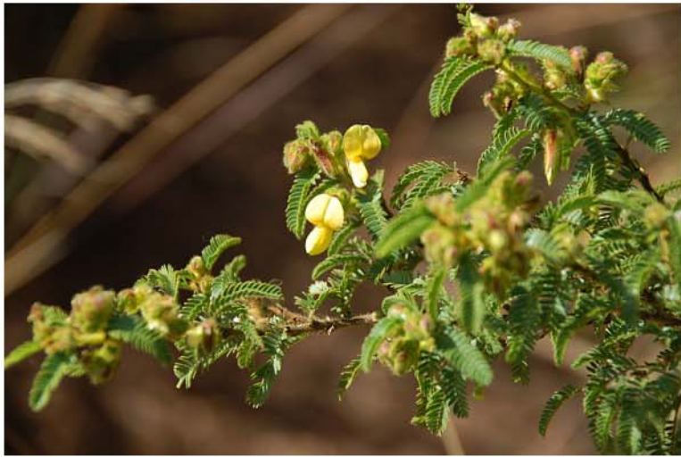
Kotschy thymodora (Baker f.) Wild Chimanimani mountains, upper reaches of Nhamadzi basin, before getting to the plateau of the Muvumodzi headwaters; E 33.08, S 19.76, alt 1650 m