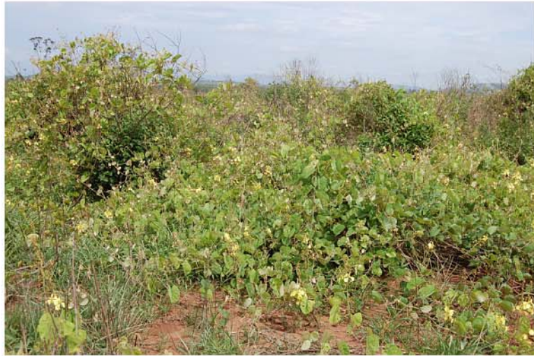
Tylosema fassoglense (Schweinf.) Torre & Hillcoat in fallow fields around ISPM; E 33.40, S 19.04, alt 700 m