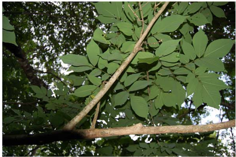
Millettia mossambicensis J.B. Gillett Sofala province, Cheringoma plateau, along marked trail in Catapú; S 18°01', E 35°18'; alt 90 m